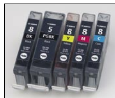
5 Individual Ink Tanks