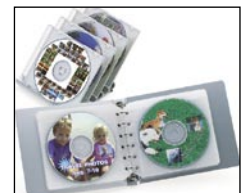
Create your own CD or DVD labels