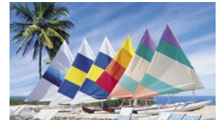
PIXMA iP5200 with photo black for heightened contrast