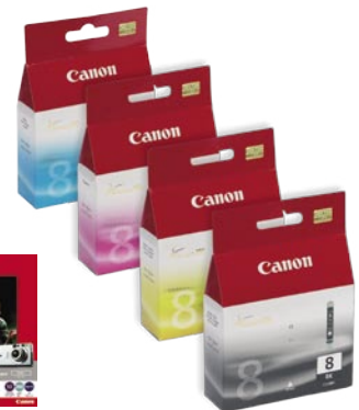
ChromaLife 100 Ink