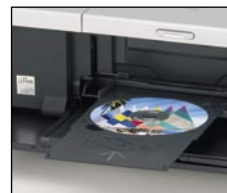
Prints directly on CD and DVD media