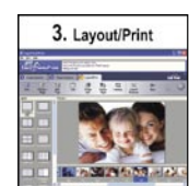
Easy-PhotoPrint – Simple 3 step process