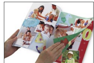
Automatic Duplex Printing