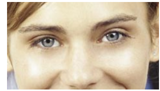
1 picolitre FINE technology eliminates graininess to produce razor-sharp images